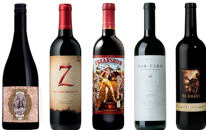
LEFT TO RIGHT: Bonny Doon Vineyard Cinsaut Cunoise blend; Michael David Winery 7 Deadly Zins and Freakshow; Oak Farm Vineyards Tievoli red blend; St. Amant Marian's Zinfandel

The Lodi Native wines, with selected vineyards from St. Amant, Macchia, m2 Wines, Fields Family Wines, McCay Cellars and Maley Brothers, are available as a six-pack at the Lodi Wine & Visitors Center and through the LoCA online wine store.