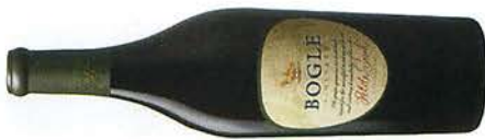
Bogle Petite Sirah, California 2011 17.5 (91)

Grapes sourced close to Santa Cruz Mountains. A small part is whole-cluster fermented with juice from the other grapes poured on top. Raspberry and cranberry aromas with spice. Pretty palate with delicate red fruit and a nice purity; medium weight with peppery finish. Top-value Pinot. Drink 2014-2016 Alc 13.5%