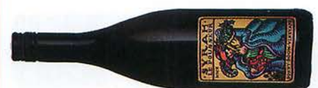
Bonny Doon Vineyard, Le Pousseur Syrah, Central Coast 2011 17.5 (91)

£14 Widely available via UK agent Enotria Petite Sirah is a descendant of Syrah and Peloursin from the south of France. Often heavy and tannic, this example is quite the opposite: it's refreshing. The fruit profile is dense with notes of plum, blackberry and black pepper. Great complexity with vibrant fruit characters. Drink 2014-2016 Alc 13.5%