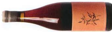
Arnot-Roberts, Luchsinger Trousseau, Clear Lake 2012 17.75 (92) £29.95 Roberson

With the exception of Jura fans, very few will have heard of, let alone tasted, a wine made from Trousseau. Hailing from California this is even more unusual. Almost as pale as a darker rosé, there's plenty of floral character with notes of strawberry and raspberry. Light-bodied with a kick from the tannins; a juicy, refreshing style. Drink 2014 Alc 12.3%